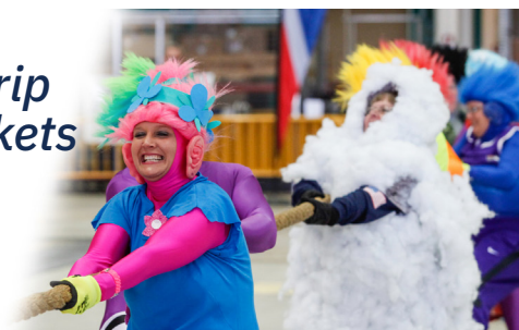
Most Spirited Award