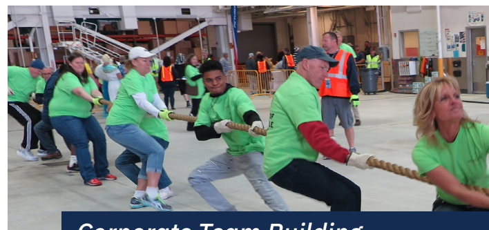
Corporate Team Building